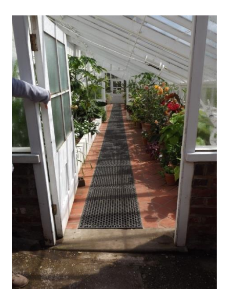
Entrance to one of the glasshouses