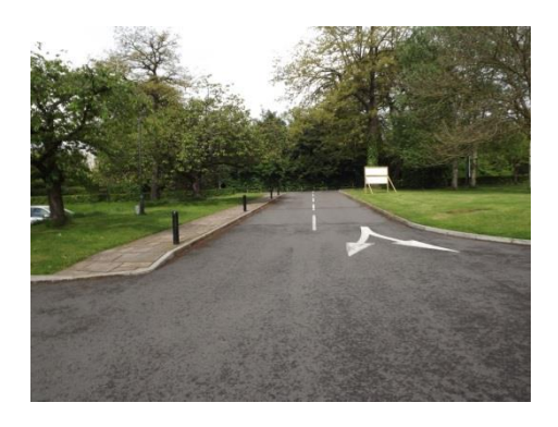
Winterbourne driveway spaces

onsite is free. Additional parking can be found at the University of Birmingham's Pritchatt's Road multi storey car park, 5 minutes walk away.