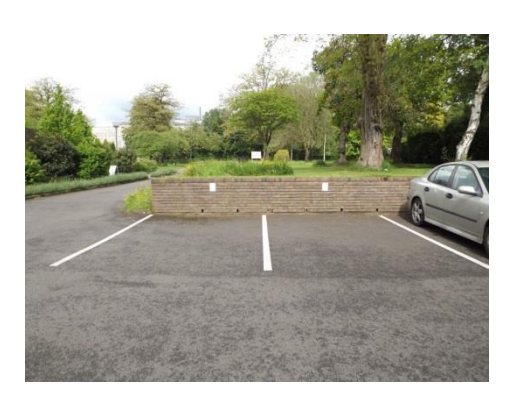
Blue badge parking