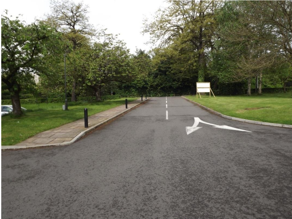
Driveway to Winterbourne