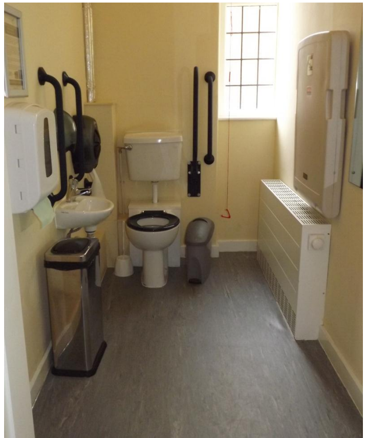
Disabled toilet in the main house