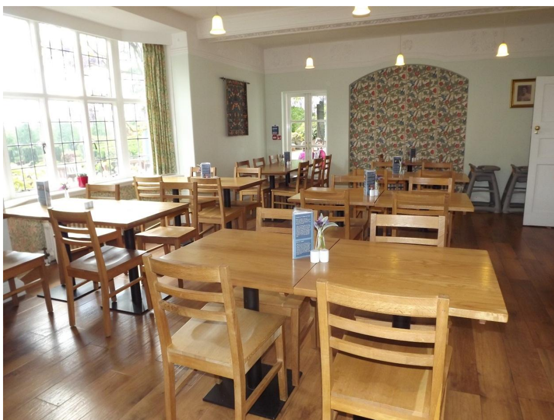
Inside the tea room