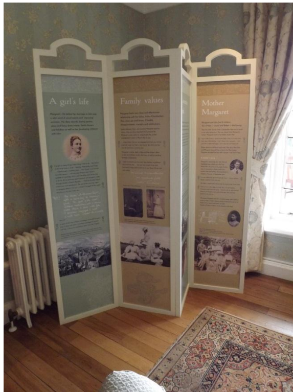
Interpretation board in the drawing room