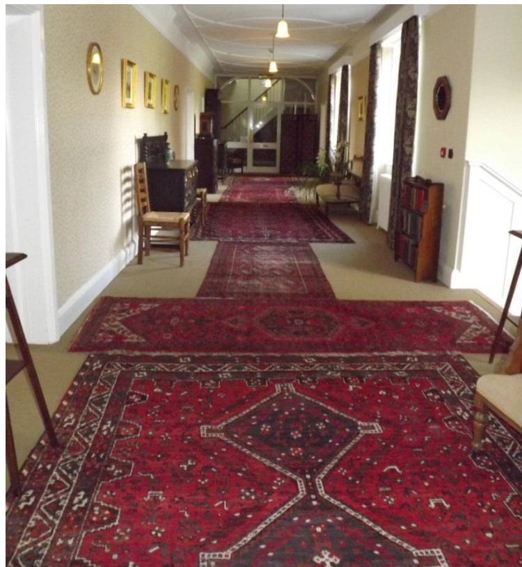
Seating available downstairs