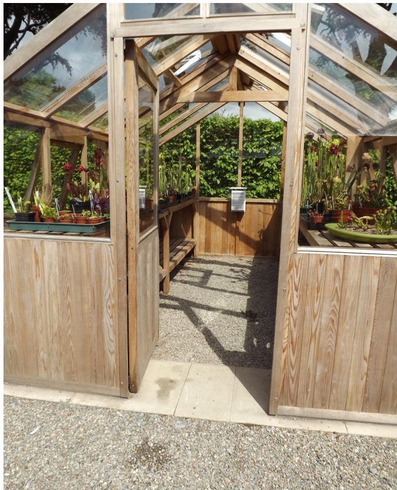
Entrance to a glass house