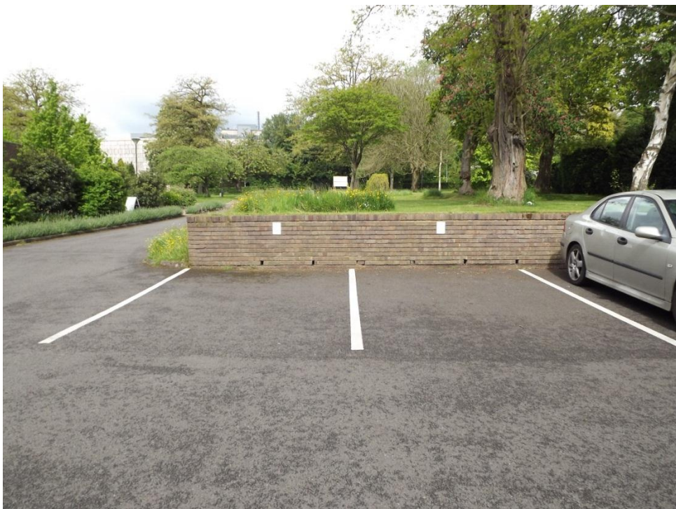
Blue badge parking spaces