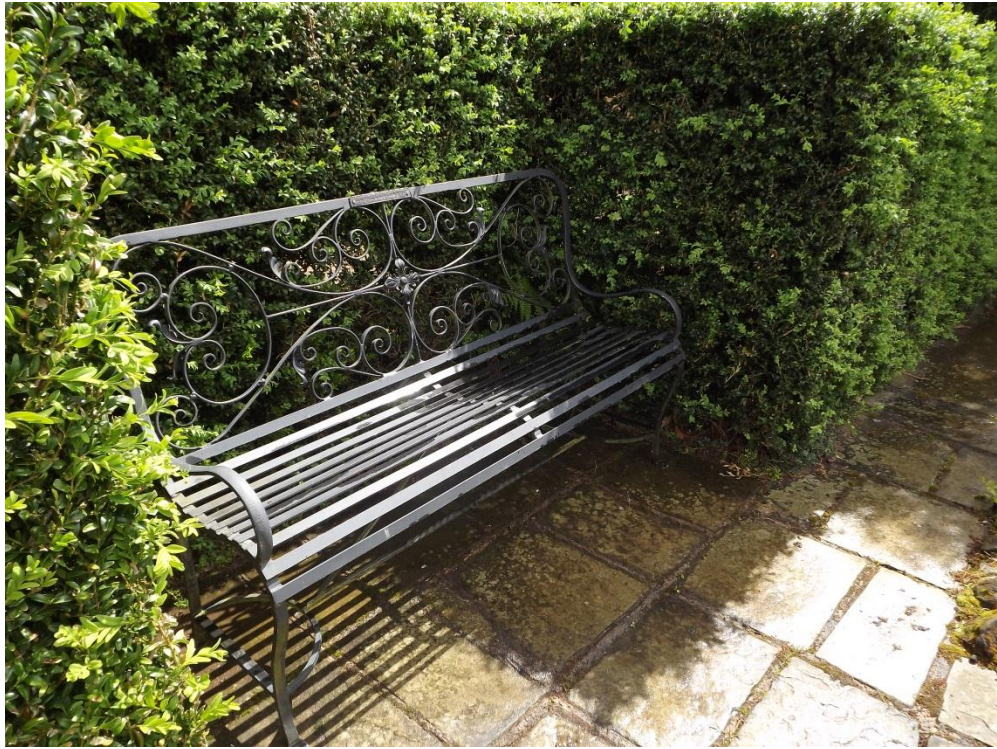
Seating available in the garden