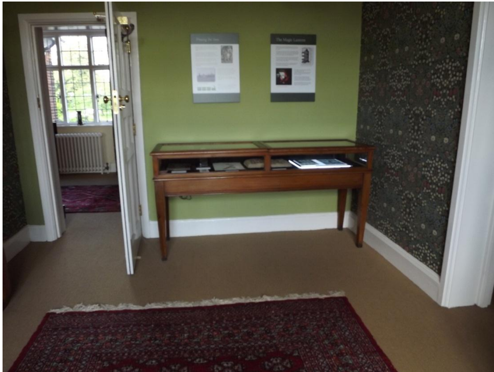
Display cabinet in the hobbies room