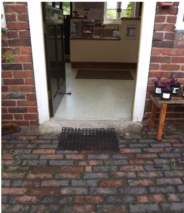
Entrance to the Gift Shop