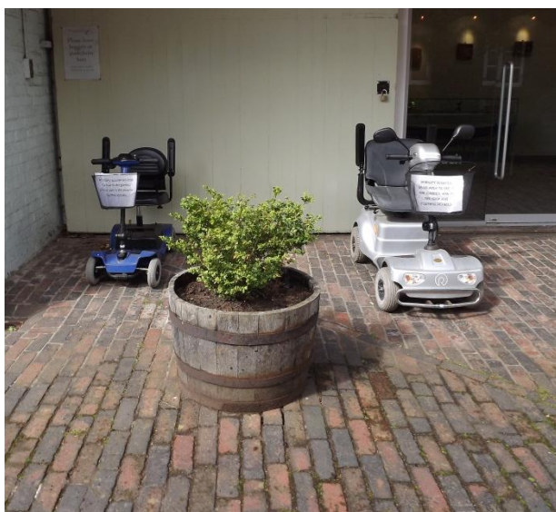
Mobility scooters for hire