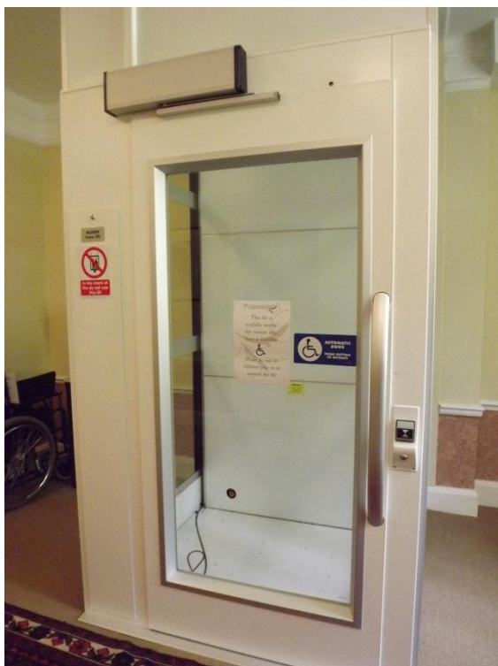
Entrance to the main house