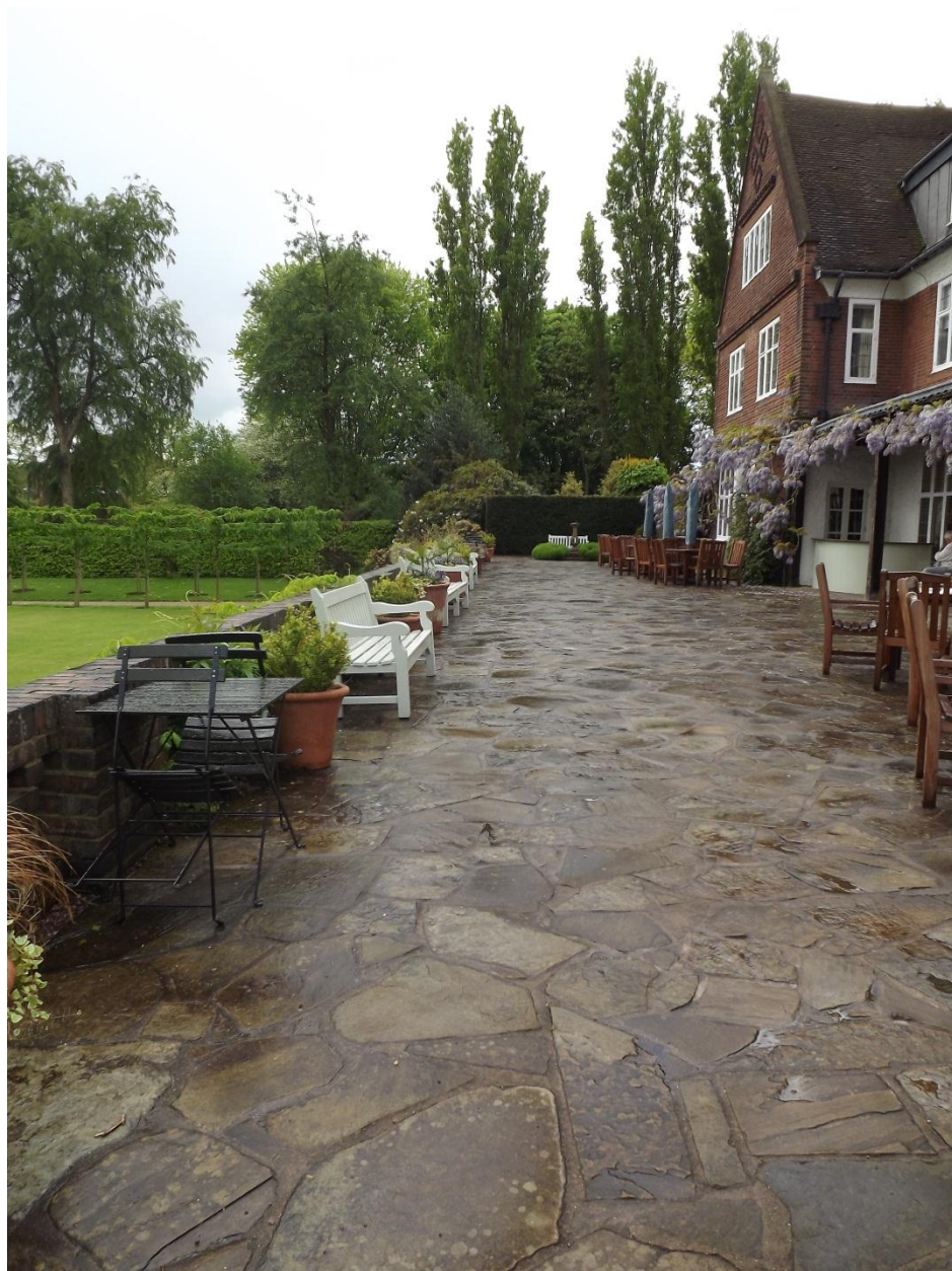
Seating on the terrace