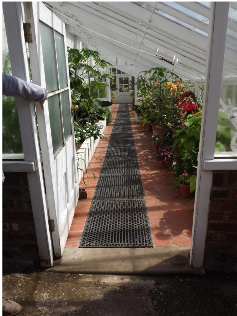
Entrance to a glass house