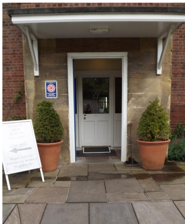
Lift available in the first exhibition room