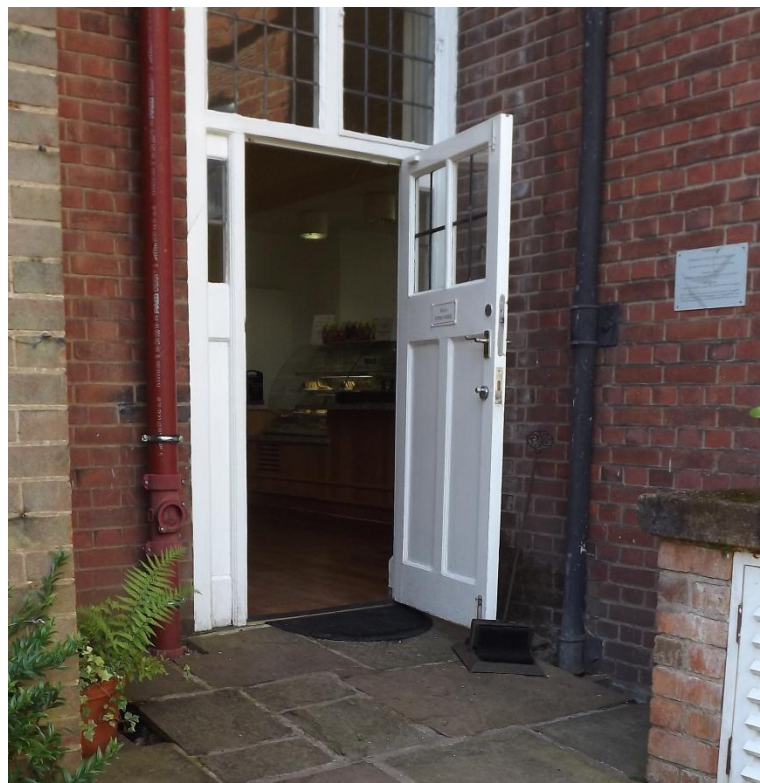
Entrance to the tea room from the terrace