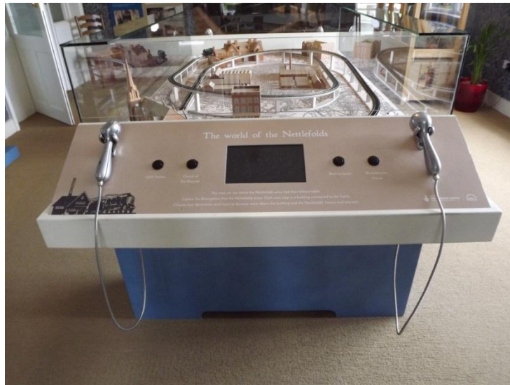
Interactive train set in the main exhibition room