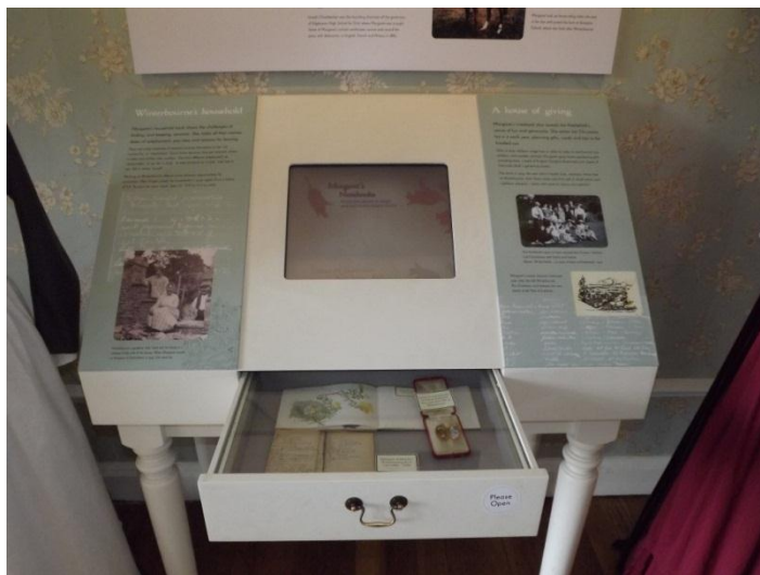
Interactive touch screen in the drawing room