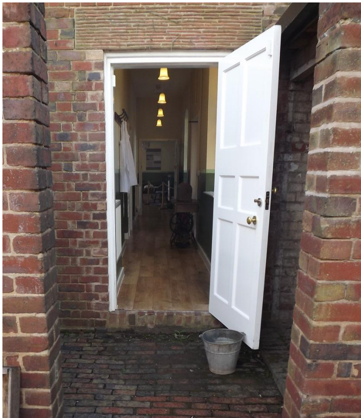
Stepped access to kitchen exhibition room