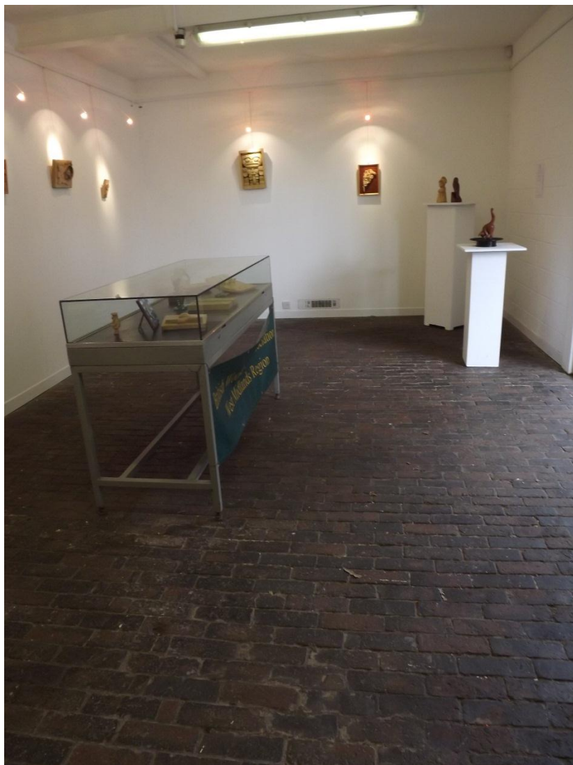
Inside the art gallery